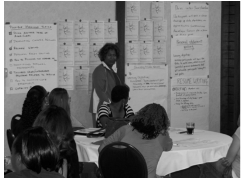
LeaderCorps Planning Retreat 2008