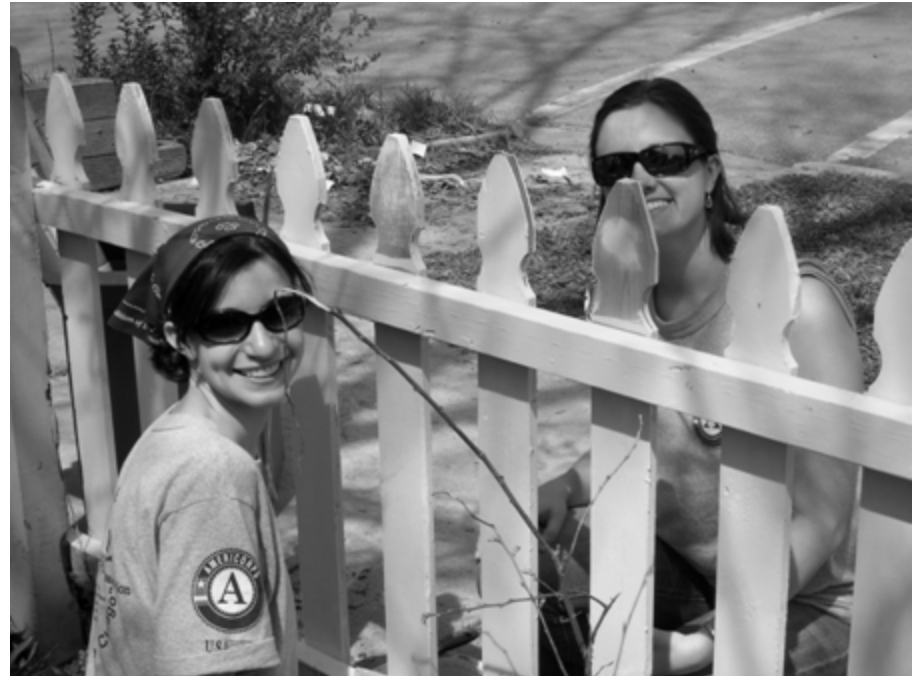
National and Global Youth Service Day 2006