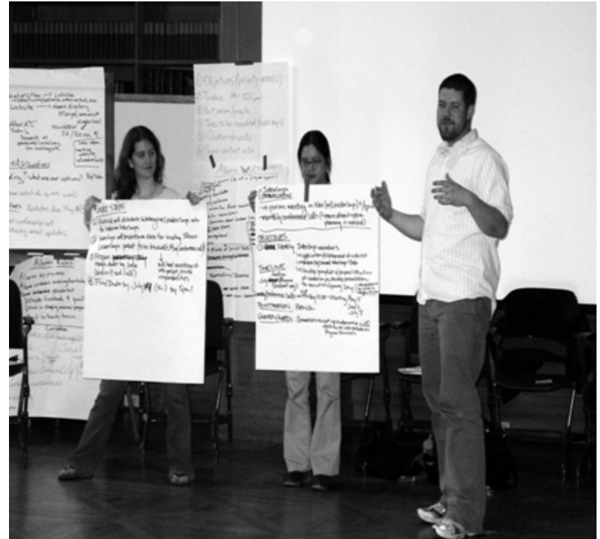
LeaderCorps Planning Retreat 2006